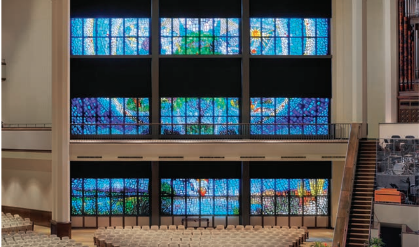
Scene 3—sheers and partial blackout