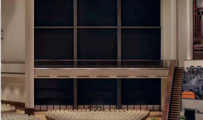
Scene 4—full blackout